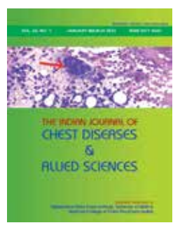
This article is available on www.vpci.org.in

Department of Respiratory Medicine<sup>1</sup>, Kalinga Institute of Medical Sciences, KIIT Deemed-tobe-University, Bhubaneswar, (Odisha), and Department of Microbiology<sup>2</sup>, National Reference Laboratory, Regional Medical Research Centre (ICMR), Bhubaneswar, (Odisha), India